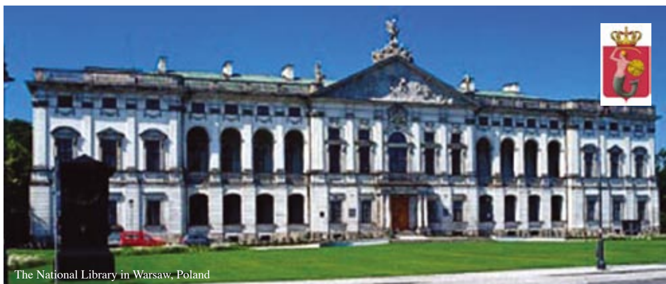
The National Library in Warsaw, Poland

We would like to invite teachers, teacher-trainers, educators, librarians, parents, and all those interested in education to take part in the Conference and to share their experience in working with the Internet at school for the promotion of reading, intercultural education and foreign language teaching.